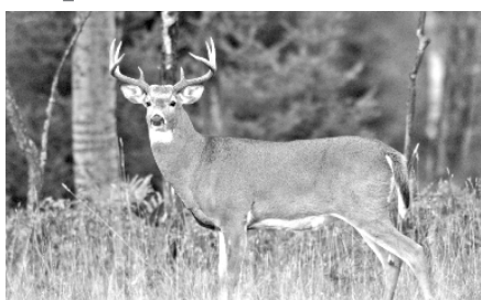
Conservation officers request hunters to buy their license before going out to pursue bucks like the one shown here, and also to not loan kill tags.