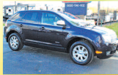
2007 LINCOLN MKX AWD, leather, navigation. AS LOW AS $249/MO.