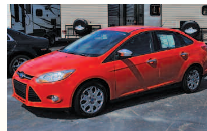
2012 FORD FOCUS SE Only 84 K, 4 cyl, 38 MPG. AS LOW AS $179/MO.