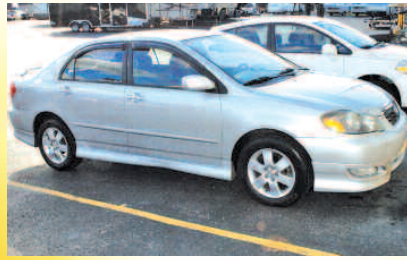
2006 TOYOTA COROLLA S Southern car, no rust. Kenwood sound. AS LOW AS $129/MO.