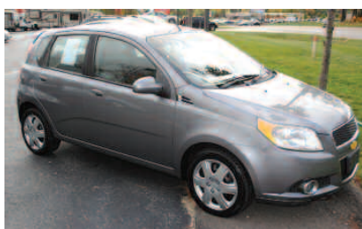
2011 CHEVY AVEO 5 LT 35 MPG, automatic. AS LOW AS $179/MO.