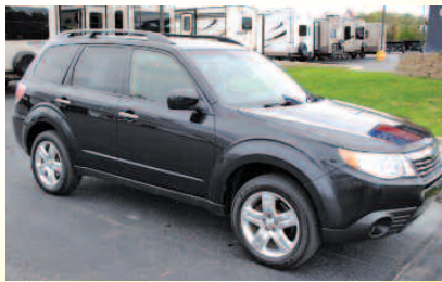
2010 SUBARU FORESTER AWD, extra large moonroof. Great car for winter. AS LOW AS $219/MO.