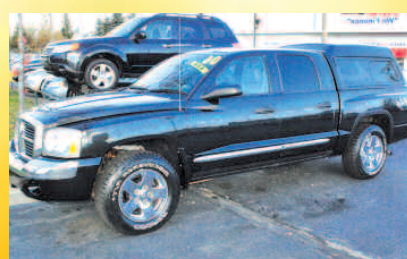
2006 DODGE DAKOTA LARAMIE 4x4, ARE fiberglass cap, tow pkg, bedliner, leather, Pioneer sound, 4 door. AS LOW AS $229/MO.