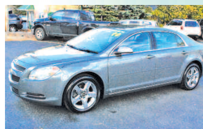
2009 CHEVY MALIBU LT Very nice. 33 MPG. AS LOW AS $199/MO.