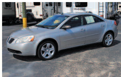
3 TO CHOOSE FROM. 2008 PONTIAC G-6 Nice car for the money! AS LOW AS $179/MO.