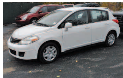
2010 NISSAN VERSA Very clean, only 89 K. AS LOW AS $189/MO.