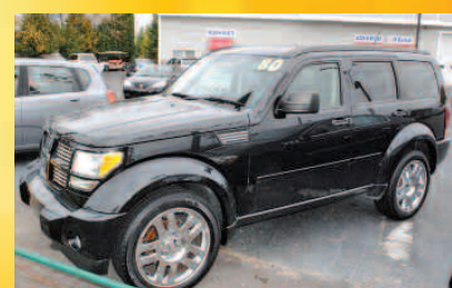
2008 DODGE NITRO R/T 4x4, power sunroof, navigation, 3rd row seat, leather. AS LOW AS $219/MO.