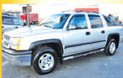
2004 CHEVY AVALANCHE 4x4, tow pkg, 4 door. AS LOW AS $279/MO.