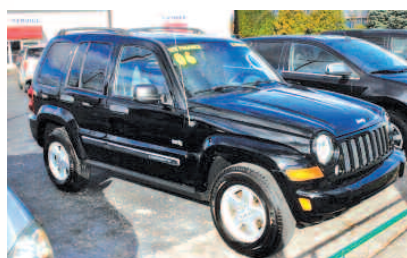
2006 JEEP LIBERTY Trail Rated 4x4, power moonroof. AS LOW AS $189/MO.

BAD CREDIT? NO PROBLEM! Guaranteed Credit Approval